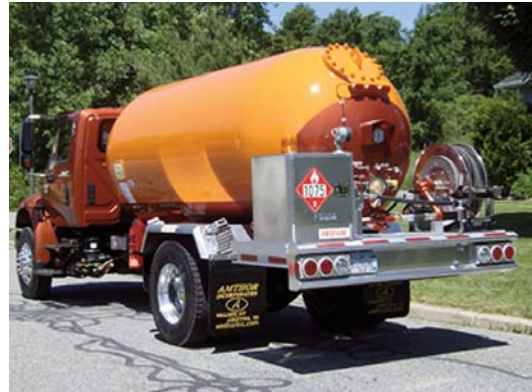
Mill Finish Bumper

Amthor International is proud to introduce a new bumper, which is 3/8" thick and comes with a lifetime no-bend warranty. It is available in a polished and mill finish look.