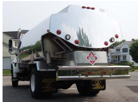
Polished Finish Bumper